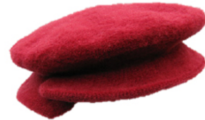
Pieter Bruegel the Elder (1568) Peasant dance [detail], Kunsthistorisches Museum, Vienna, Austria; split-brimmed knitted cap (V&A Museum, London; knitted cap reconstruction by Rachel Frost and The Tudor Tailor ©